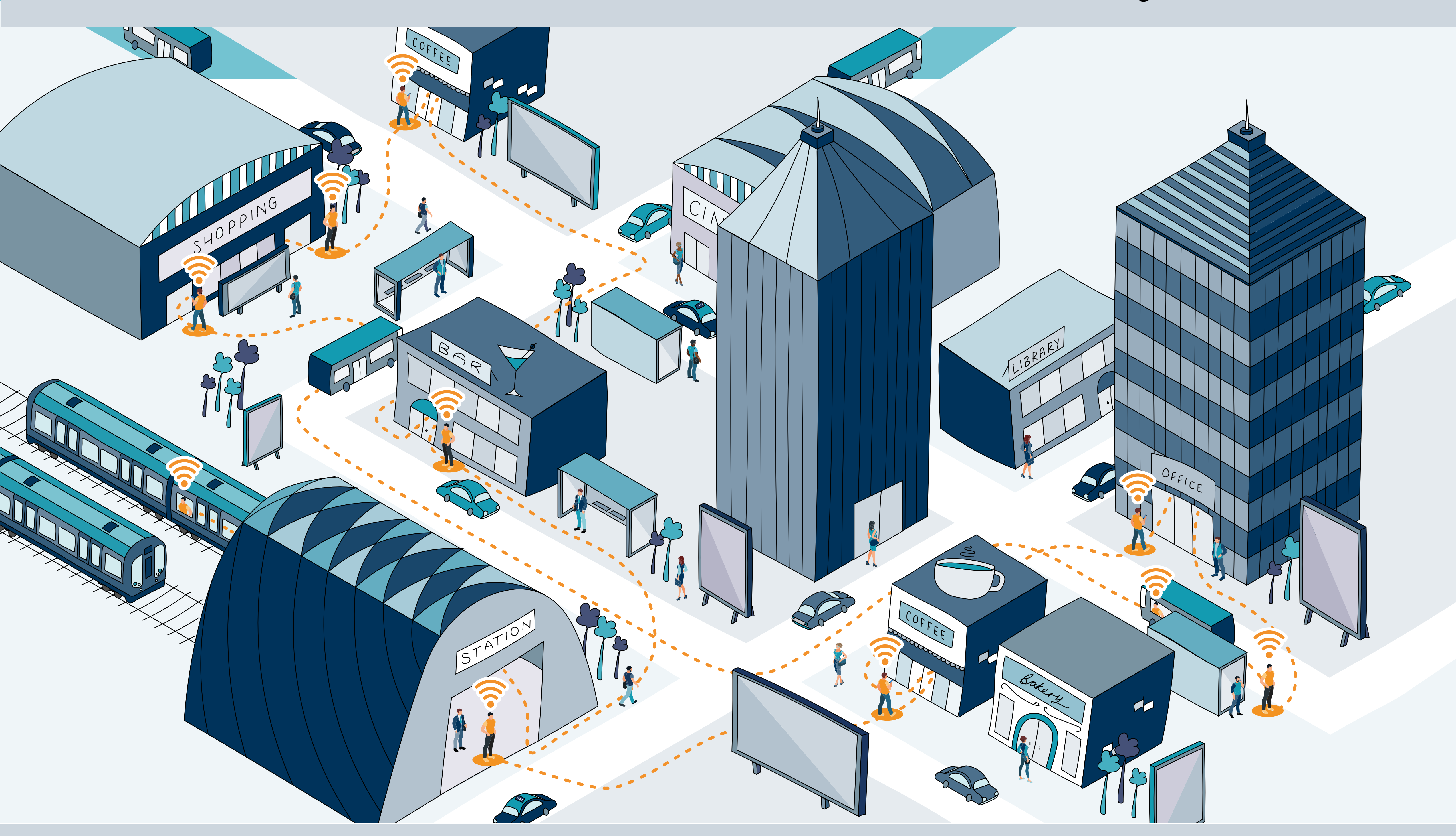
IDENTIFYING TRAFFIC: Vehicular Data